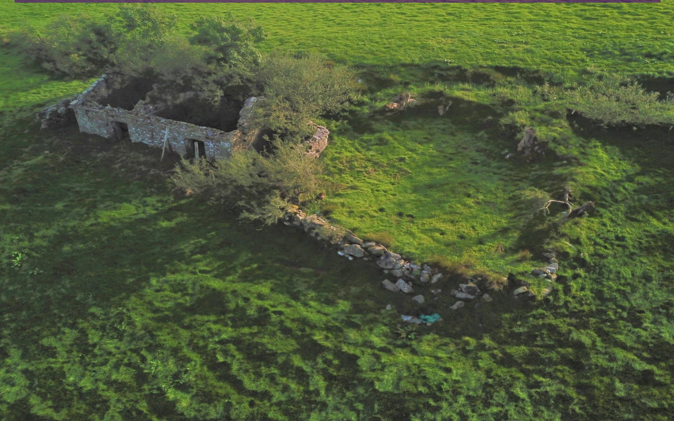
Adeilad / Outbuilding at Tan Y Clawdd , Capel Uchaf, Clynog Fawr, Caernarfon LL54 5DL